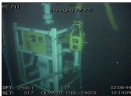
Iris on well at 2950ft water depth.