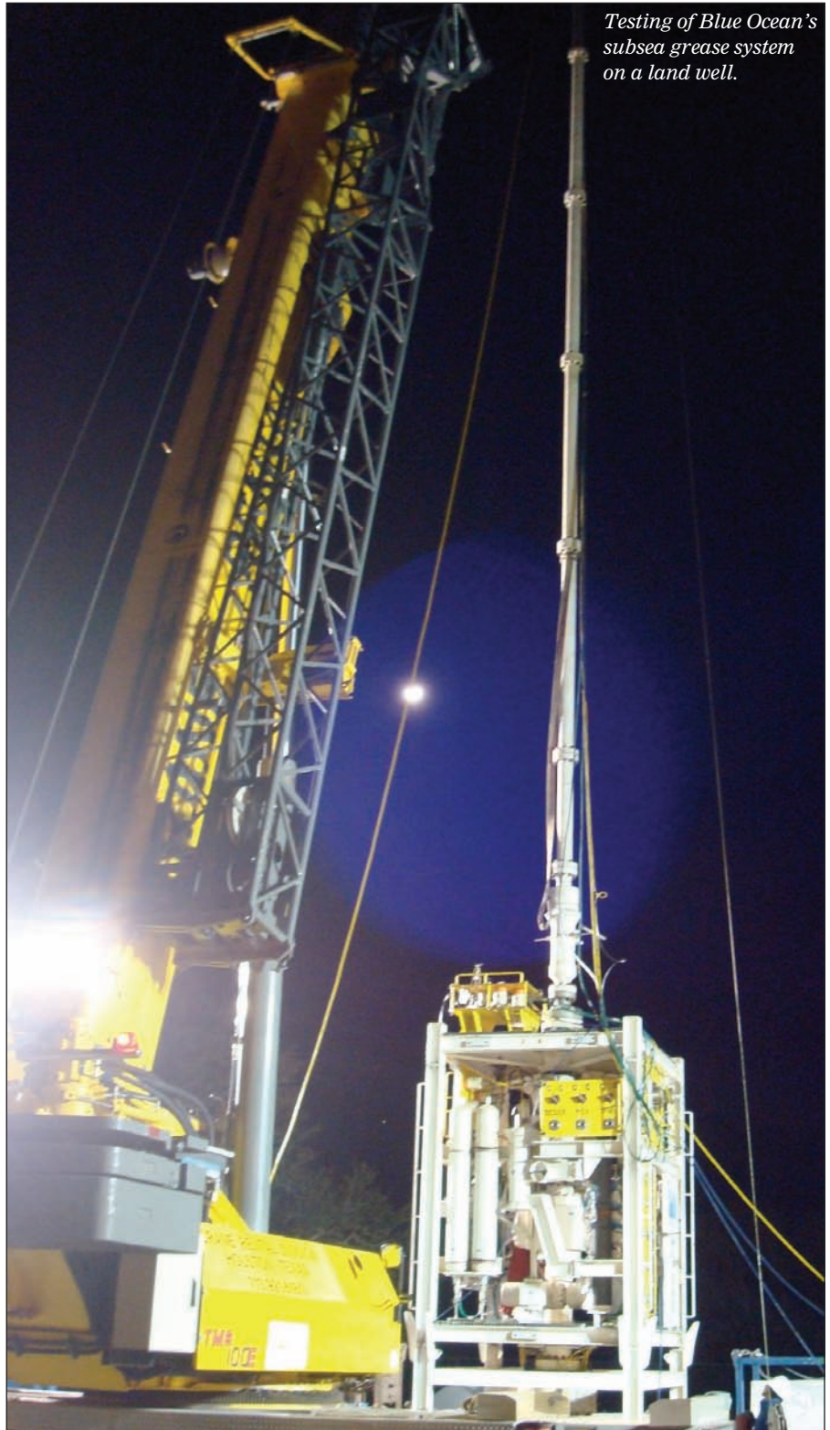
Testing of Blue Ocean's subsea grease system on a land well.