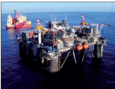
The ATP Innovator produces the Gomez field in MC711 in 3000ft of water.

Blue Ocean expects to commission a second Iris system – to be known as Idris (interchangeable deepwater riserless intervention system) – by end 2010. OE